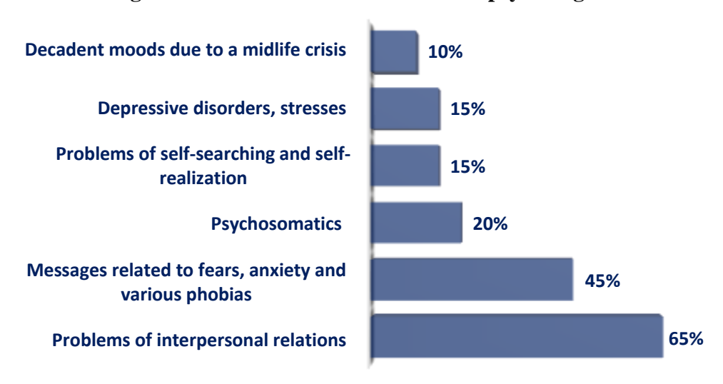
Figure 3. Problems that clients turn to psychologists

Further descending represent: psychosomatics -20%, problems of self-searching and self-realization - 15%, depressive disorders, stresses - 15%, decadent moods due to a midlife crisis - 10%. Psychologists also note an increase in appeals from clients with different sexual orientations who are trying to solve problems of gender identity and establish strong relationships in a homosexual couple (Figure 3).