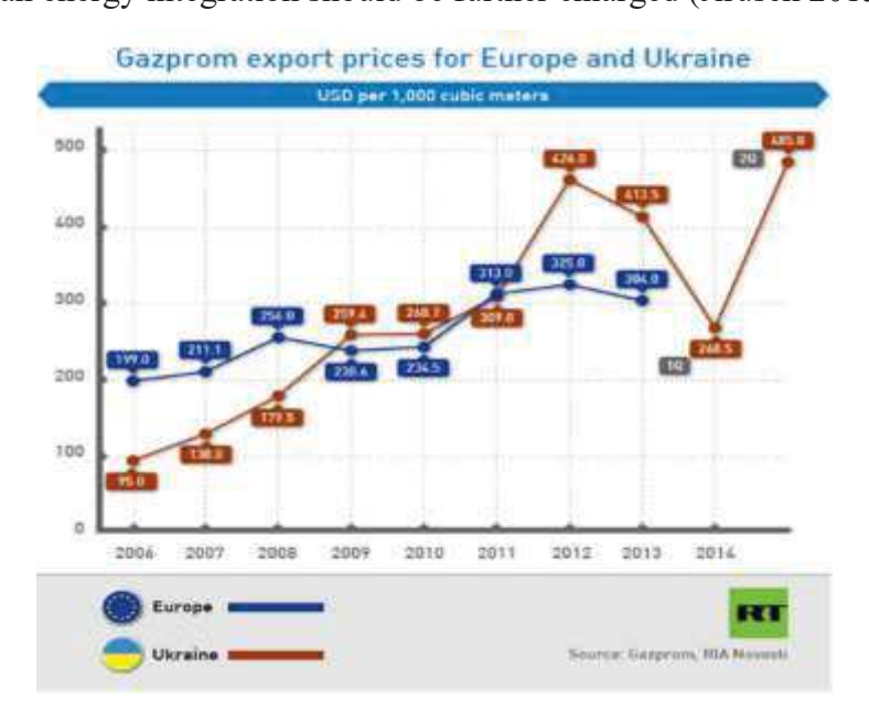
Figure 3: Russian gas price for Ukraine and Europe

USD per 1000 cubic meter in 2014, this meaning a price increase of 97%<sup>17</sup>. So, it will be asked which of economies would resist such a dramatic increase of prices on energy supply? Is it impartial to charge to different consumers such different prices on same energy resources? This why, the European energy integration should be further enlarged (Jirušek 2015).